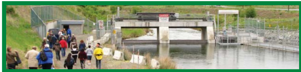
Walking down for a tour of Nicola Dam at the Fraser Assembly.